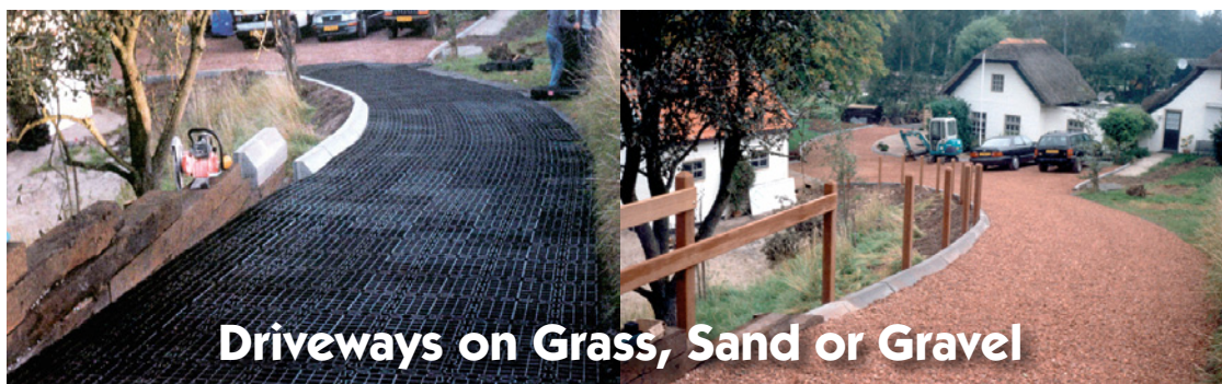
Driveways on Grass, Sand or Gravel