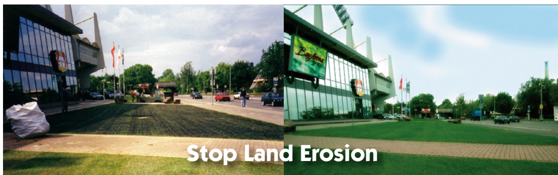
Stop Land Erosion

Less Asphalt or Concrete Natural Drainage Greener & Cooler Environment Cost Effective Eco Friendly Durable