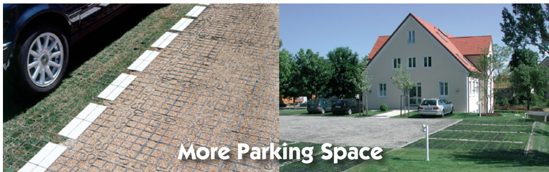
More Parking Space